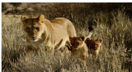
Lioness and cubs