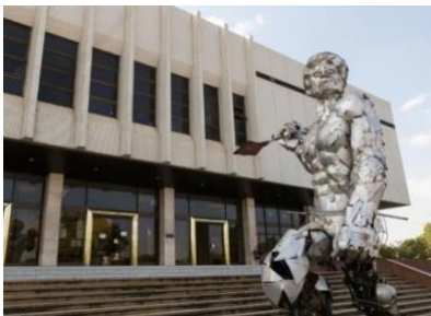
Lusaka National Museum