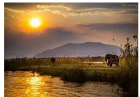
Lower Zambezi NP