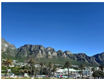
12 Apostles, Table Mountain