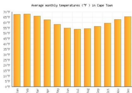
Cape Town Temperature