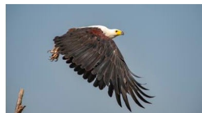
African Fish Eagle