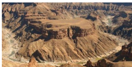
Fish River Canyon