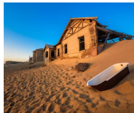
Kolmanskop Ghost Town