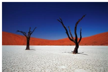
Dead Vlei, Sossusvlei